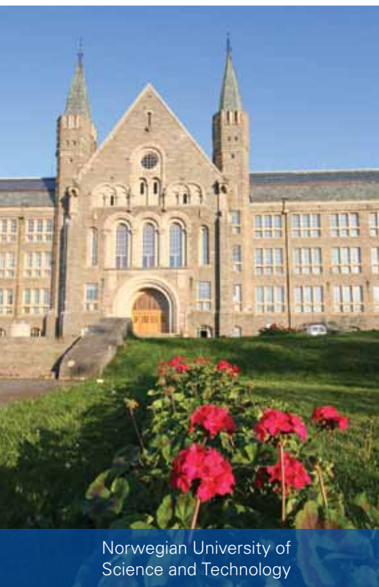
Norwegian University of Science and Technology