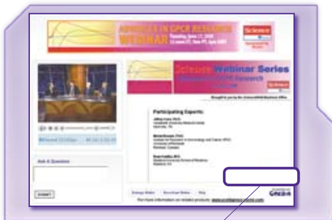
Sponsor Company Logo

Please contact your sales representative for rates and additional information.